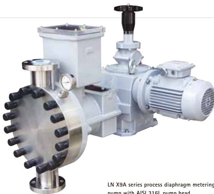
LN X9A series process diaphragm metering pump with AISI 316L pump head.